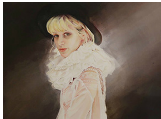
“Apathy & Good Books”