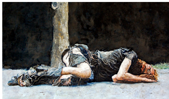
“Yet Another Day”