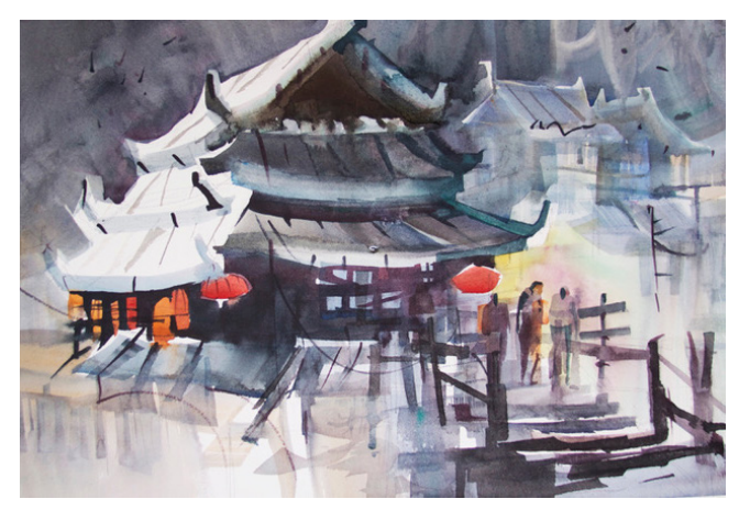
John Salmenin, "Red Lanterns"

As I venture out with my camera, I try to keep an open mind. Going out looking for a pre-conceived subject can yield a specific useable photo but it's often the little unexpected surprises that end up being developed into a painting. I do like the 'magic times' of early morning and late afternoon when the light tends to be flattering. I shoot with both my 35 mm camera and my cell phone but in the spontaneous and unexpected moments my cell phone is perfect. It's always with me and I find myself pulling it out even when I'm not actively looking.