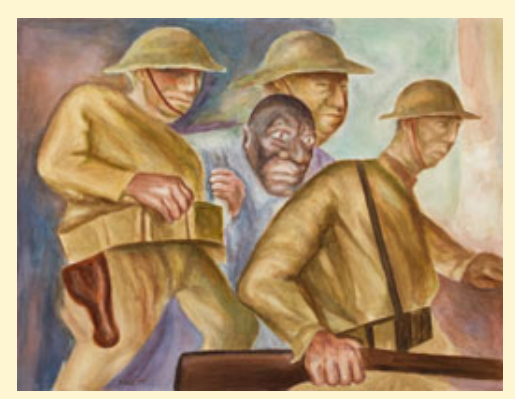
Crawford Gillis, "In Custody (Project for a Southern Armory)"

I came upon a watercolor by Crawford Gillis (1914-2000), "In Custody (Project for a Southern Armory)," that was painted in 1936 and is part of the permanent collection of the Montgomery Museum of Fine Arts. The fear depicted in 1936 is still as bracing as today but it brought home for me the fact that not enough has changed over all these years.