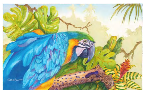
Deborah Rae Hall, "Paradise Blue"