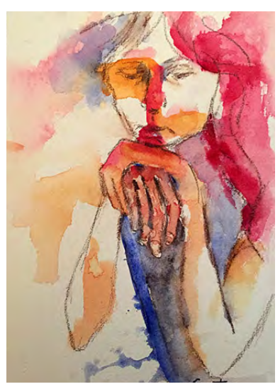
By Rosemary Segreti