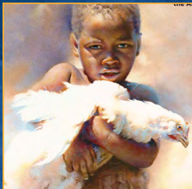
Detail from "Token of Honor"