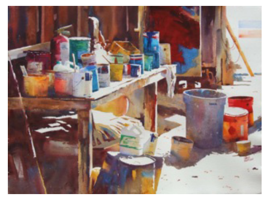
2nd Place – Charles Sharpe "Inside the Paint Shed"