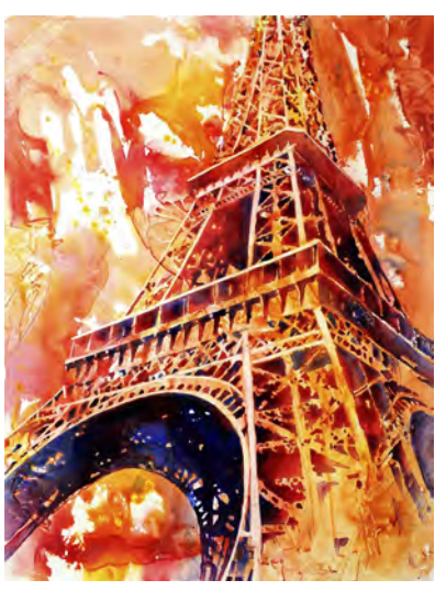
Ryan Fox "Video Killed The Radio Star"

Over 2,000 people visited the GWS National Exhibition at OUMA!