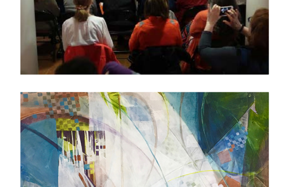
Kathleen Conover's play on a sailboat