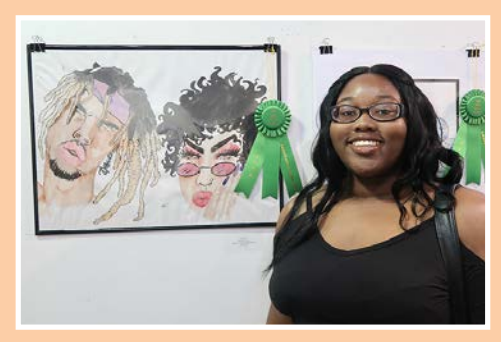
Shiniyah Evans, "Untitled 2"