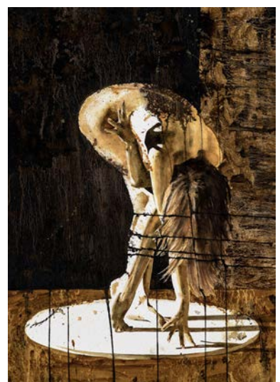
Ric Skees, "Torment"