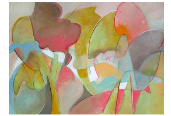
Kristin Herzog, "Plüchow Landscape II"