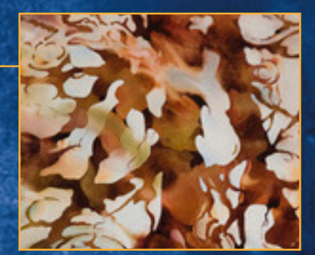
Detail from "Reflections"