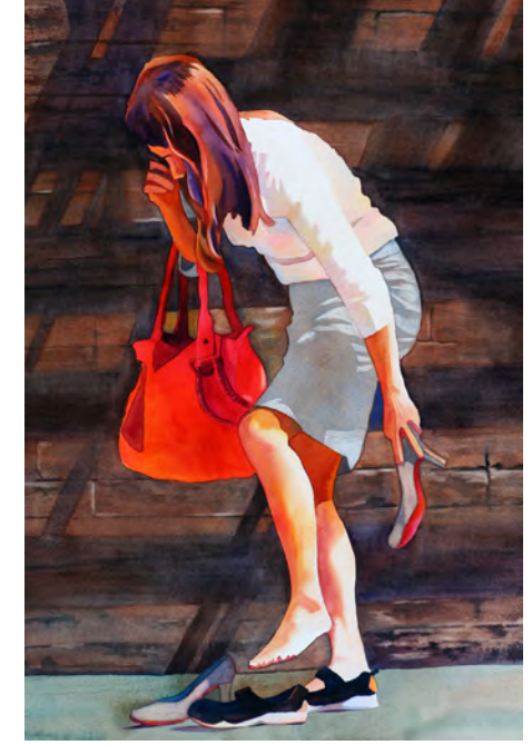
"A New York Moment"

I have three DVDs from Martin F. Weber Company that are just now available. In these DVDs I will be explaining and demonstrating the "New Anne" by taking you through the steps of computer enhancement and the mixing and painting of the picture.