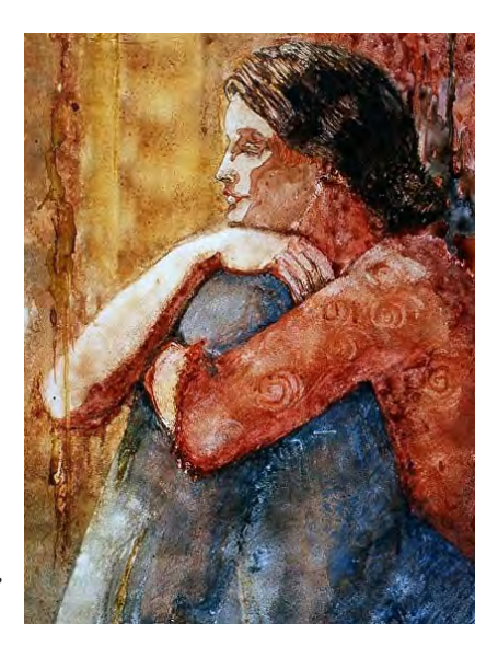
"Deep in Thought"

My studio is located at Kudzu Art Zone in Norcross. The group of printmaking artists at Kudzu is having a printmaking show of our work July 22-Aug 2nd.