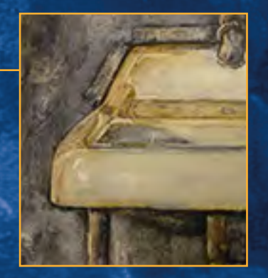
Detail from "Lavabo (Sink)"