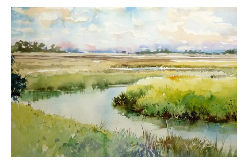
Dwight Rose, "Fripp Island"