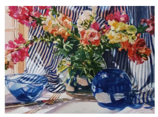
Anne Hightower-Patterson, "Morning Snaps"

I follow both my color and value studies when painting.