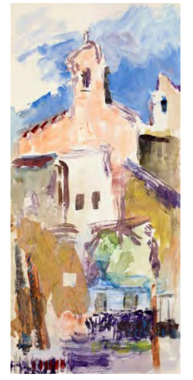
David McCully "Backstreet View"