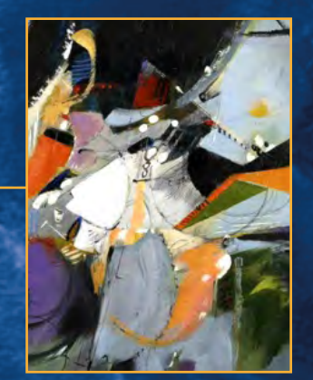
Detail from "Moonlight Nocturne III"