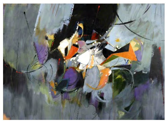
"Moonlight Nocturne III"

My most significant accomplishment as an artist for me came when I put the AWS, NWS after my name.