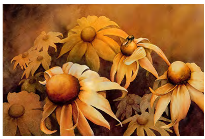
"Taking a Bow Gold"

What a treat for us! Plan to attend Kie's demo.