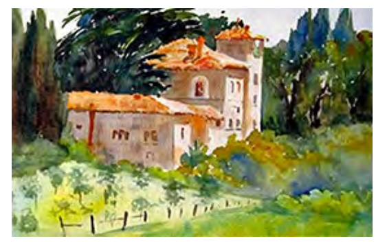
Pat Fiorello, "Villa at Vagliagli"

in Paris and along the Brittany coast. For details and a brochure: <a href="http://www.artbykrf.com/WC-Journaling-Brochure2014.pdf">http://www.artbykrf.com/WC-Journaling-Brochure2014.pdf</a>.