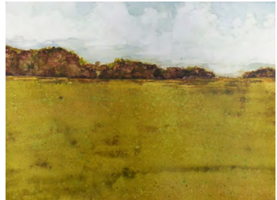
Kathy Kitz, "Rural Landscape"

Watercolor on Yupo with Kathy Kitz, 5 Mondays, 2/5 - 3/12 (skip 3/5) 10 AM - 12:30 PM