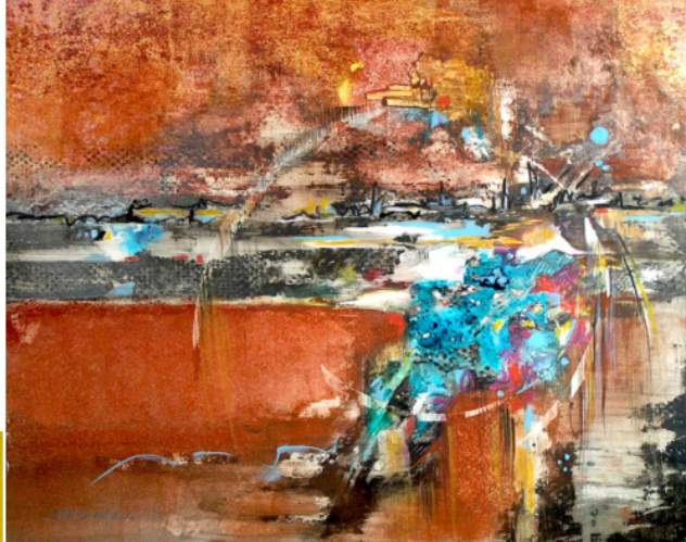
Sample from "Dreamcatcher" series