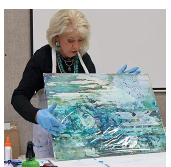
Example of a "pull"