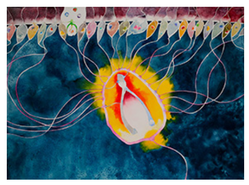
"Electrolytic Wishbone, Marbles and Embryonic Beans"