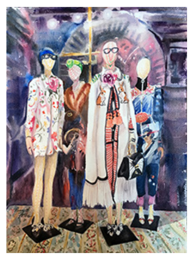
"Florence Fashion Reflections"