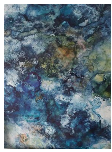
"Rainbow Colors in the Stream"