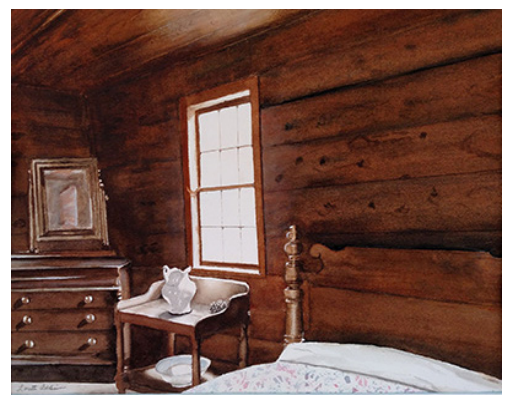
"Traveler's Rest, Bedroom"